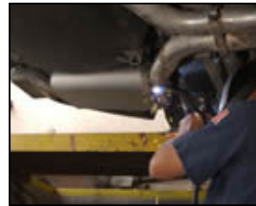
Click image for larger view

A key element of Flowmaster's unique Delta-Flow Technology are the three, delta-shaped reflectors inside the second chamber of the cutaway 50-Series unit, above. The key to the Delta-Flow's ability to reduce noise at no expense to performance is the precise positioning (to a tolerance of .004-in) of