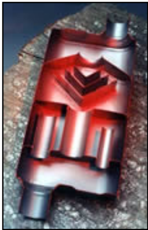
Click image for larger view

three-chamber muffler with a case that is 17x9.75x4-inches, considerably larger than the mufflers of a standard Flowmaster cat-back. A 50-Series Delta-Flow is different from a standard Flowmaster 50-Series unit in that its rear chamber contains multiple, V- or 'delta'-shaped deflectors (as opposed to the single deflector in non-Delta-Flow units) which split, then reform exhaust flow in a manner that has phase shifts reducing acoustic energy. Generally, Delta-Flow mufflers have the same flow numbers as the equivalent non-Delta-Flow muffler but are quieter. The particular 50-Series Delta-Flows we used (PN 843051) have three-inch connections with the inlet offset and the outlet centered.