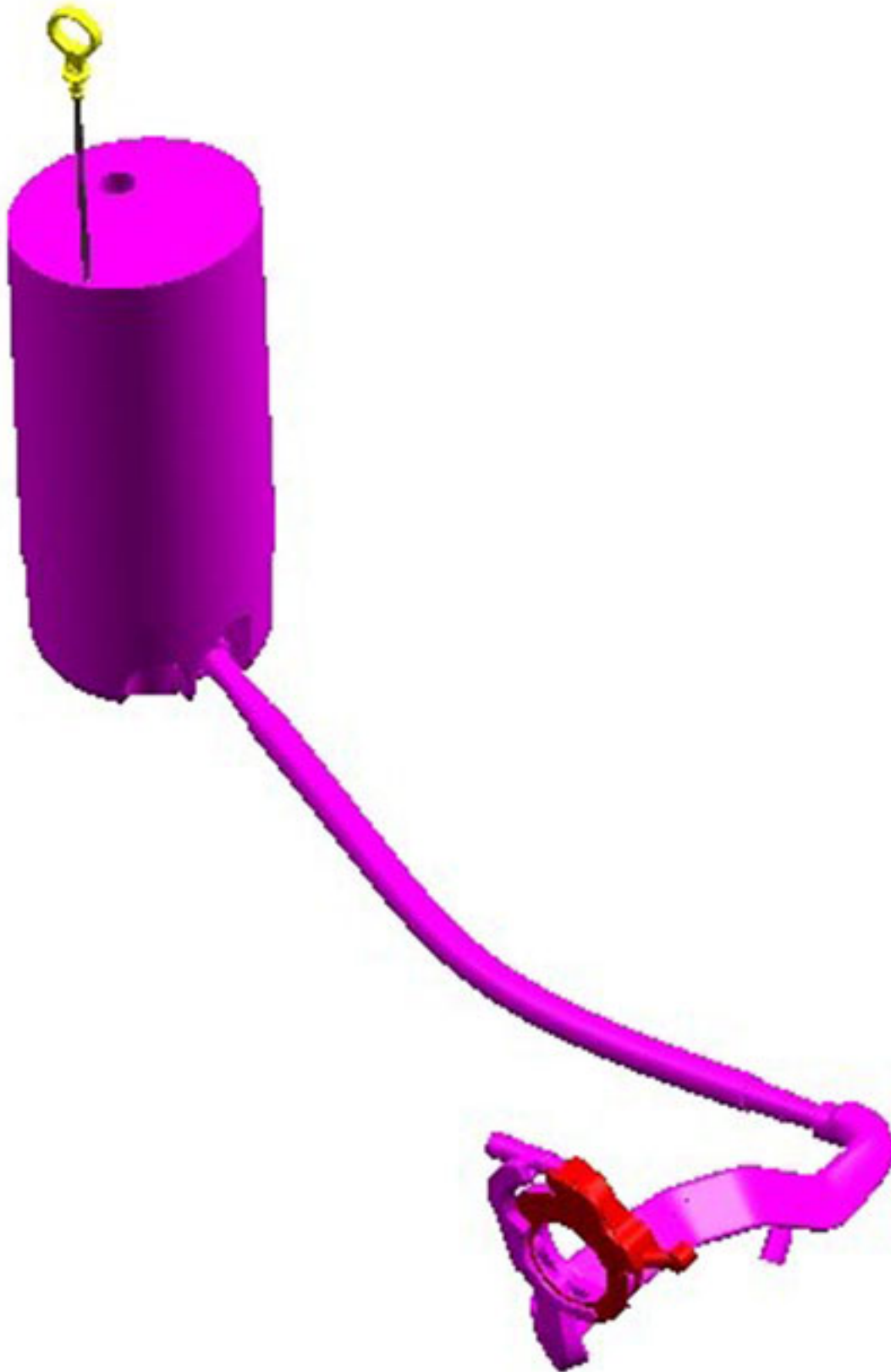
Checking the Oil Level