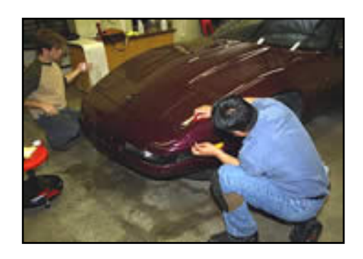
Click image for larger view

Once the Transparent Bra is positioned, smoothing it, removing any air bubbles and getting it to conform to curved surfaces takes skill, knowledge, patience and some specific application tools.