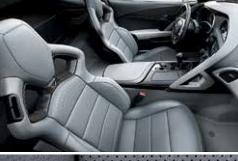
Gray Leather Seating Surfaces with Available Competition Sport Seats (3LT)