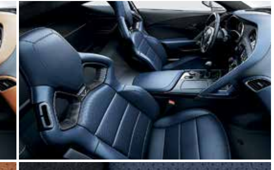
Blue Leather Seating Surfaces with Available Competition Sport Seats (3LZ)

Kalahari Leather Seating Surfaces with Sueded Microfiber Inserts (3LT)