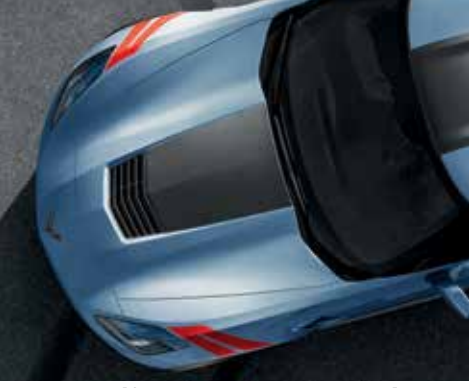
Gray Center Stripe<sup>5,8</sup> with Torch Red Fender Hash Marks<sup>7</sup>