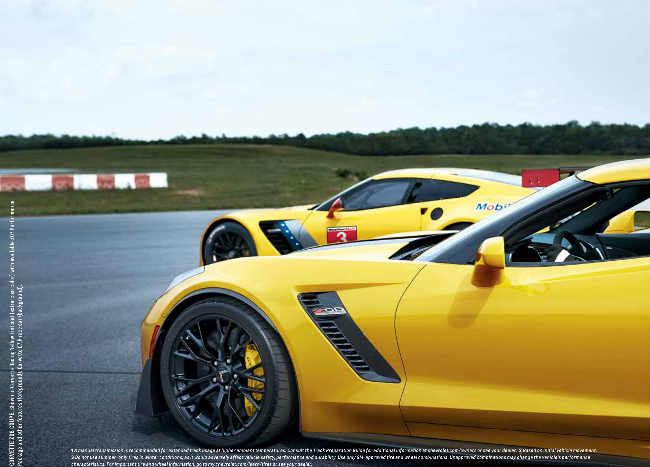
3 Do not use summer-only tires in winter conditions, as it would adversely affect vehicle safety, performance and durability. Use only GM-approved tire and wheel combinations. Unapproved combinations may change the vehicle's performance characteristics. For important tire and wheel information, go to my.chevrolet.com/learn/tires or see your dealer.