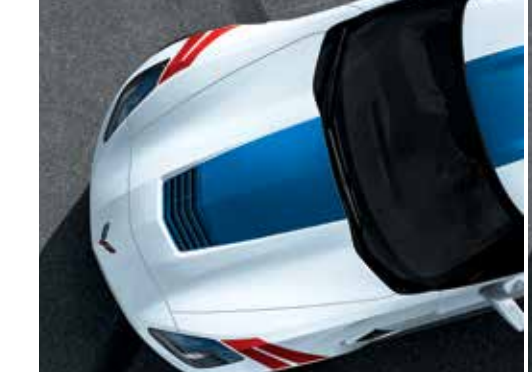
Blue Center Stripe<sup>5,9</sup> with Torch Red Fender Hash Marks<sup>7</sup>