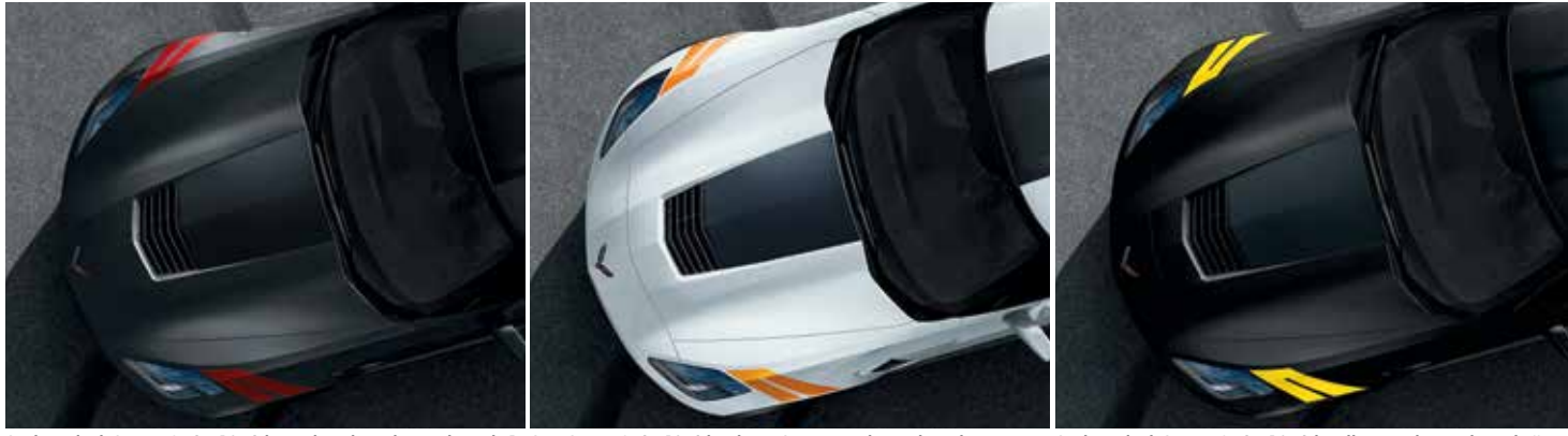
Carbon Flash Center Stripe<sup>5, 6</sup> with Torch Red Fender Hash Marks<sup>7</sup> Gray Center Stripe<sup>5, 8</sup> with Volcano Orange Fender Hash Marks