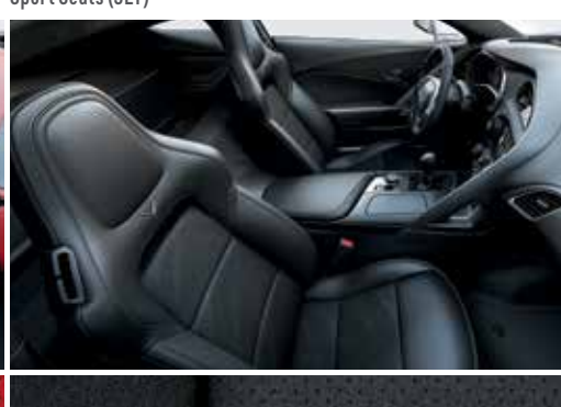
Adrenaline Red Leather Seating Surfaces with Available Competition Jet Black Leather Seating Surfaces with Sueded Microfiber Inserts (3LT) Sport Seats<sup>1</sup> (3LZ)