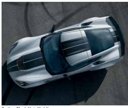
Carbon Flash Metallic<sup>6,14</sup>