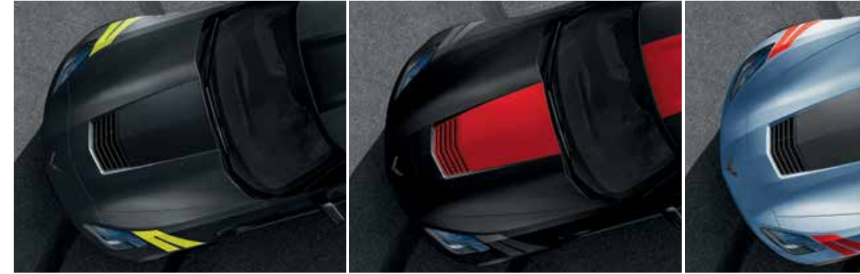
Carbon Flash Center Stripe<sup>5, 6</sup> with Hyper Green Fender Hash Marks Red Center Stripe<sup>5, 7</sup> with Gray Fender Hash Marks<sup>8</sup>