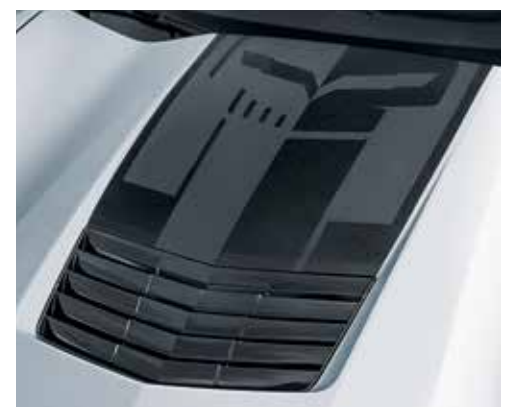
Jake Carbon Flash Metallic Two-Tone<sup>6,12</sup>