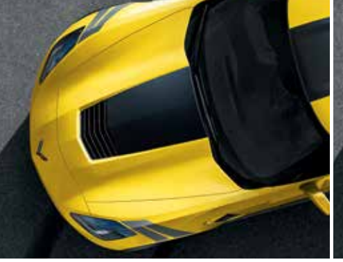
Carbon Flash Center Stripe<sup>5,6</sup> with Gray Fender Hash Marks<sup>8</sup>